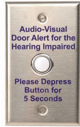
NOTE: Shown with 620 push button, not included.