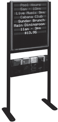
Cat. No. MC8-16C1