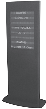
Cat. No. MC8-16C1-1