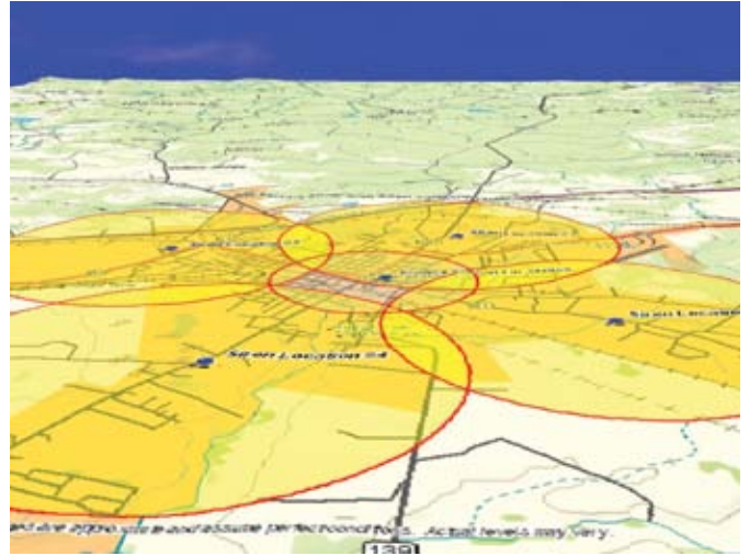
Map 2: 3-D Image for topographical study