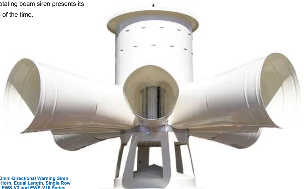
Omni-Directional Warning Siren 8 Horn, Equal Length, Single Row EWS-V3 and EWS-V10 Series

At Edwards, we specialize in designing custom siren systems to best fit any given project. Our no charge, no obligation Siren Survey will take away the guesswork. Just call and we will connect you to a site designer who will produce a scale, topographical map of your project, complete with suggested siren placement, siren models, activation equipment, and estimated costs. Let us know what you want to do and Edwards will help make your project a reality. See Map 1 and Map 2 on the following page for examples of 2-D and 3-D project maps.